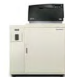
SecureVault 2000 with workstation (above) and the SecureVault 1000 (right).