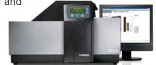
Non-laminating HDP600 shown with Fargo Asure ID software