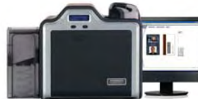
Non-laminating HDP5000 shown with Fargo Asure ID software