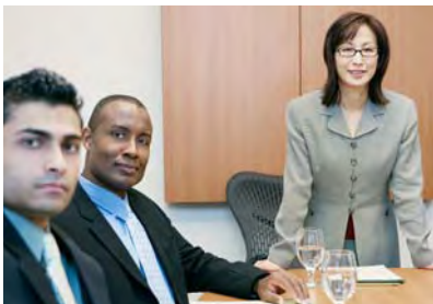
FARGO SECURE INTEGRATORS

DON'T THINK YOU HAVE TO DO THIS ALONE. FARGO HAS EXPERTS ALL OVER THE WORLD.