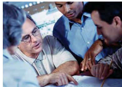
FARGO SECURE PROFESSIONAL SERVICES

Authorized Fargo integrators have one critical mission: help you get the most from your Fargo Card Identity System. After installing more than 140,000 systems in over 80 countries, Fargo integrators have the real-world experience to implement anything from high-security access control to charging a cafeteria lunch with a student ID. And Fargo integrators keep up to date with ongoing training from Fargo. So when your security depends on a Fargo Card Identity System, depend first on your authorized Fargo integrator.